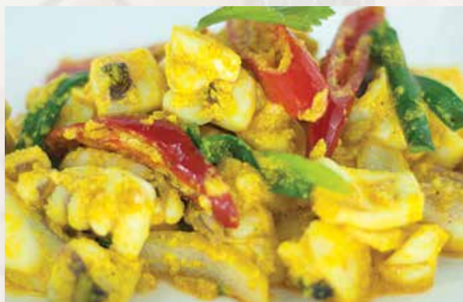
S3 咖喱粉炒苏东 (S)RM 20.00/碟 Squid Cooked with Curry Powder (B)RM 30.00/碟