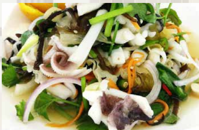
K6 鱿鱼泰国沙拉 (S)RM 18.00/碟 Squid Thai Salad (B)RM 23.00/碟