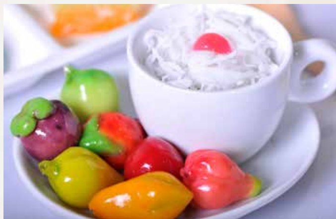
W10 Luk Chup