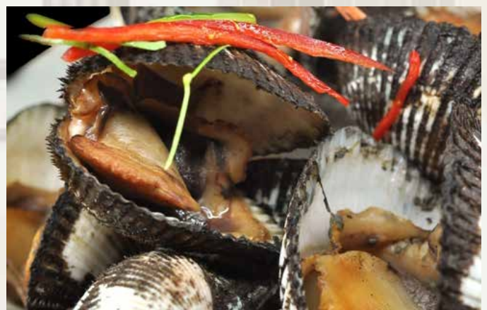
Q6 烧烤大蚶 Bbq Big Cockles