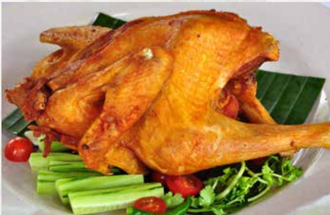
A3 炸甘榜鸡 Fried Kampung Chicken