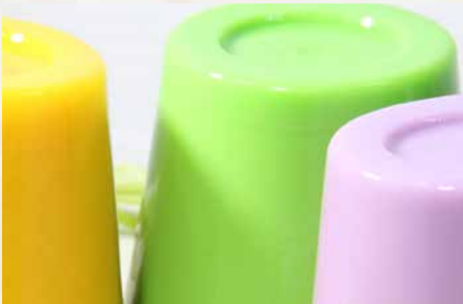
W13 Green Tea Jelly