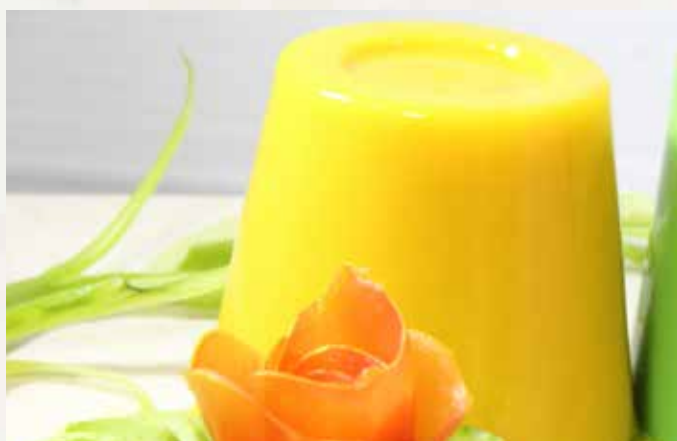
W8 Manggo Pudding