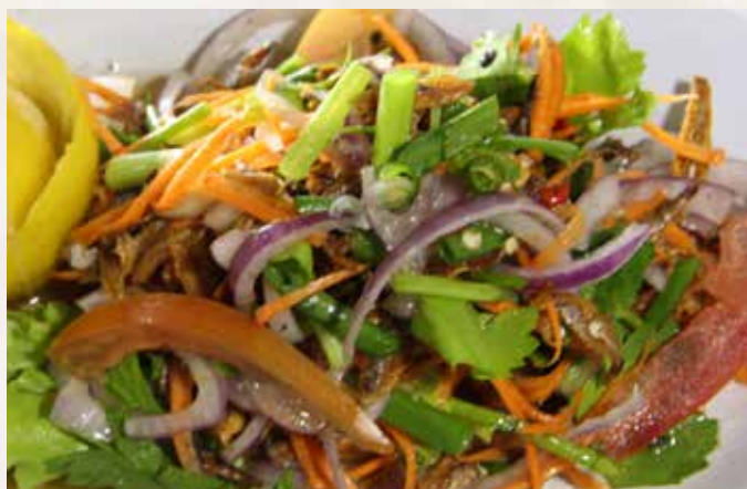
K5 江鱼仔泰国沙拉 (S)RM 12.00/碟 Anchovies Thai Salad (B)RM 18.00/碟