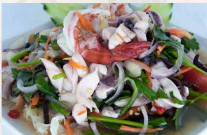
K4 海鲜泰国沙拉 (S)RM 18.00/碟 Seafood Thai Salad (B)RM 23.00/碟