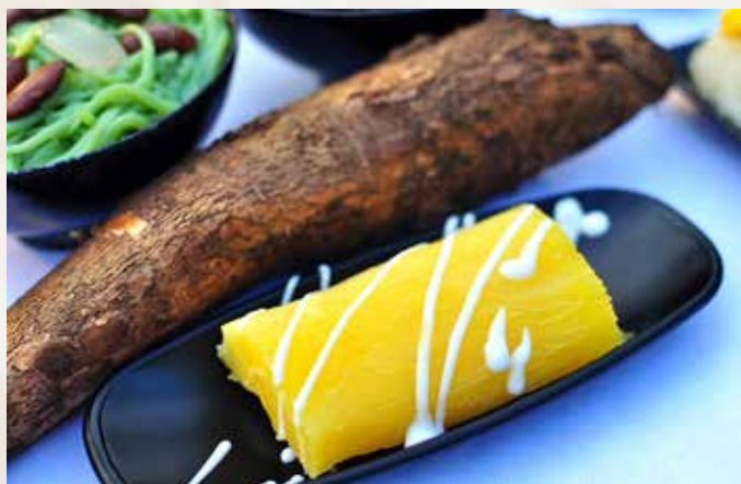
W7 Steam Tapioca