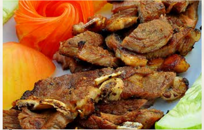
Q4 烧烤羊肉 Bbq Lamb