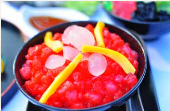
W1 Tub Tib Krob