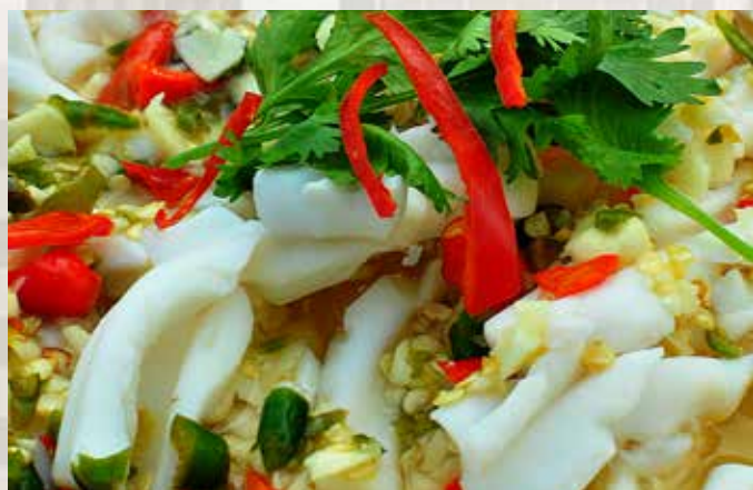
S6 青柠蒸苏东 RM 36.00/碟 Squid Steam with Lime Sauce