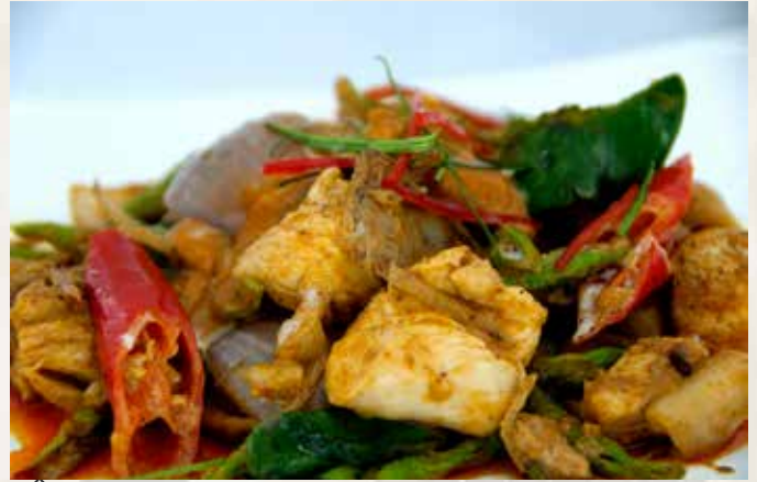
A4 辣鸡肉 Spicy Chicken