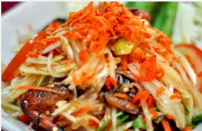
PPY2 泰式青木瓜沙拉 Som Tom Poo Pala