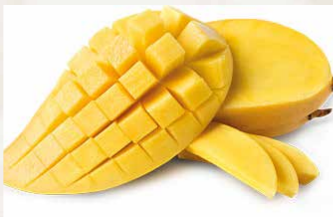
W11 新鲜芒果 Fresh Mango Only