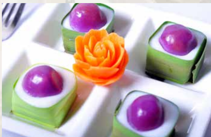
W9 Sai Sai