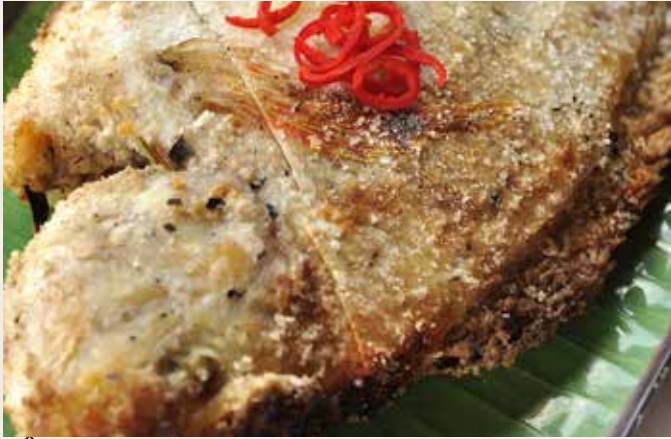
Q1 烧烤金凤鱼 Bbq Talapia