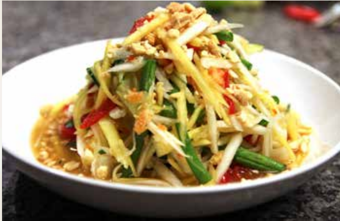
PPY1 泰式青木瓜沙拉 Som Tam