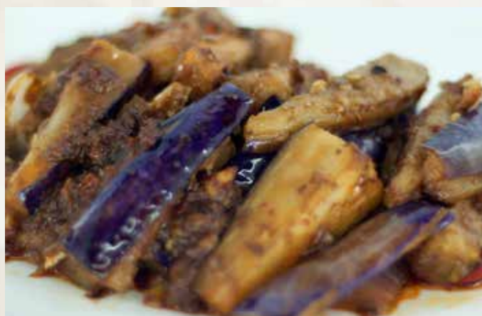
ST1 马来栈炒矮瓜 Belacan Eggplant