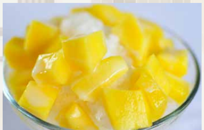
W17 Mango Coconut Milk