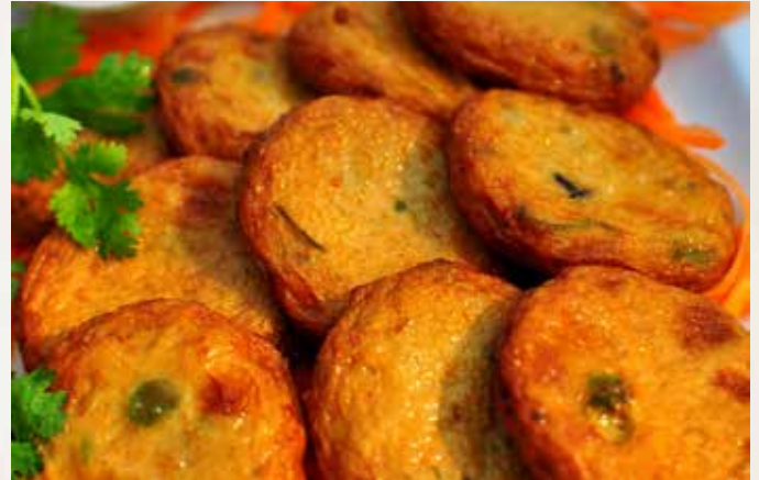
FC1 泰式鱼饼 Fish Cake