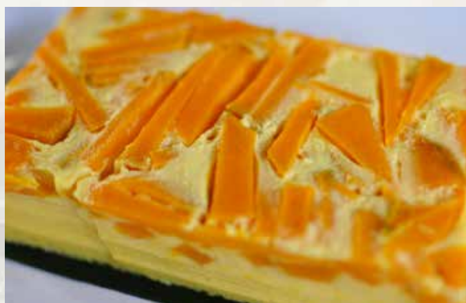
W12 南瓜 Pumpkin Custard