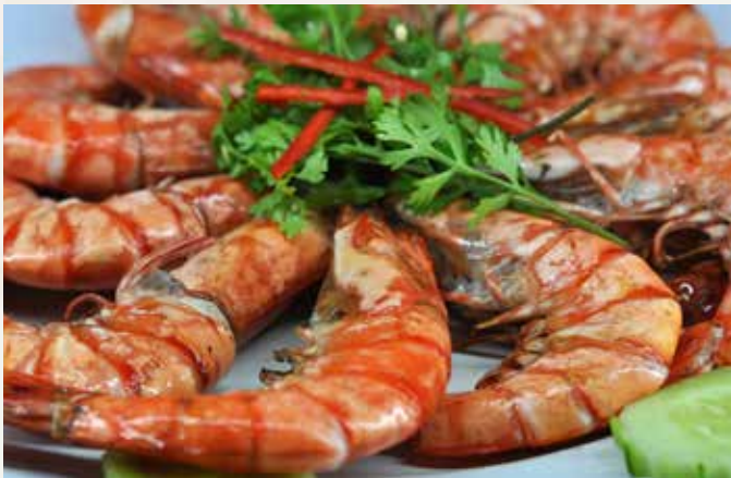
Q2 烧烤虾 Bbq Prawn