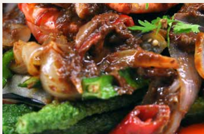
SE2 马来栈炒四大天王 Belacan Fried 4 Vege