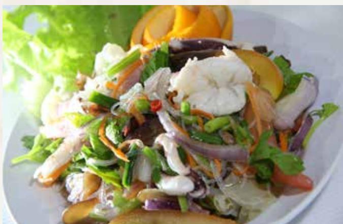
K3 冬粉泰国沙拉 (S)RM 18.00/碟 So-Hoon noodle Salad (B)RM 23.00/碟