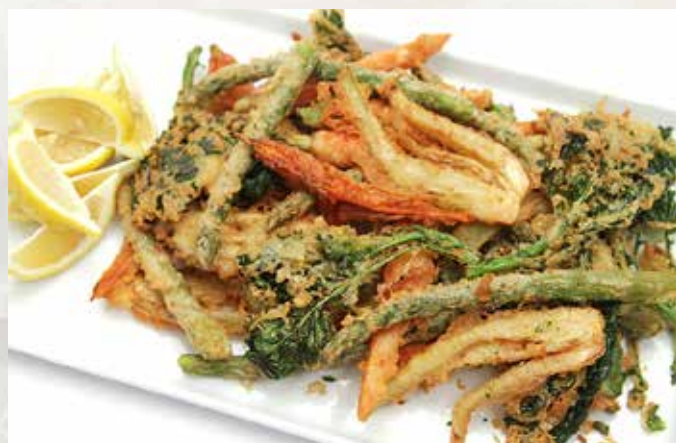
SE3 香炸6杂菜 Fried 6 Vege