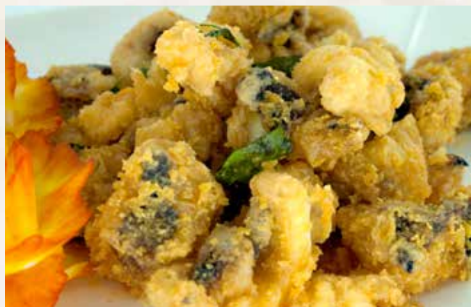
S4 咸蛋苏东 (S)RM 23.00/碟 Squid Salted Egg (B)RM 33.00/碟