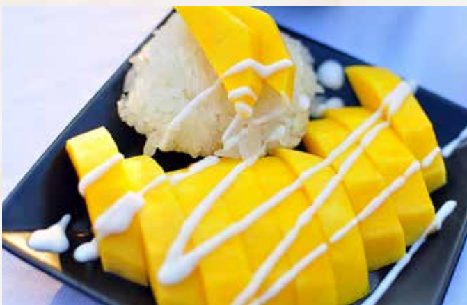
W2 Mango Sticky Rice