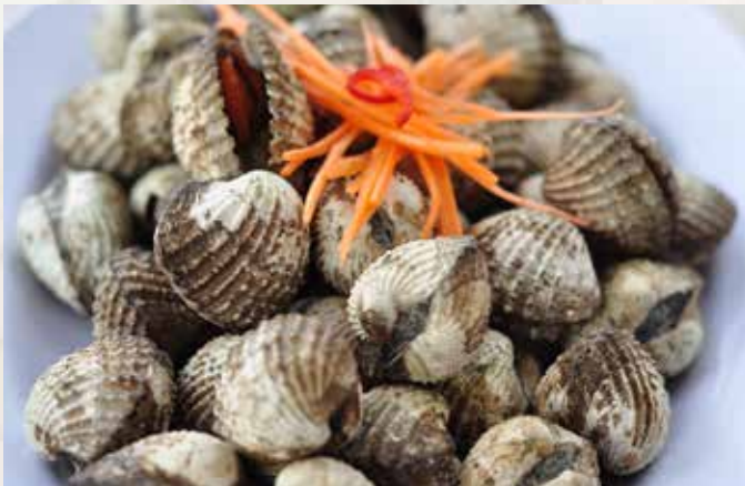
Q5 烧烤蚶 Bbq Cockles