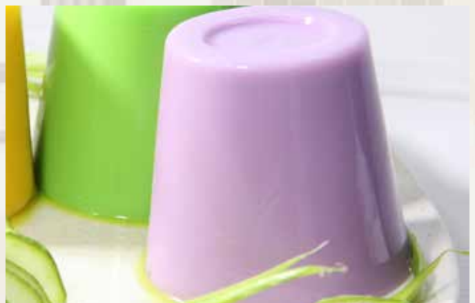
W5 Yam Pudding