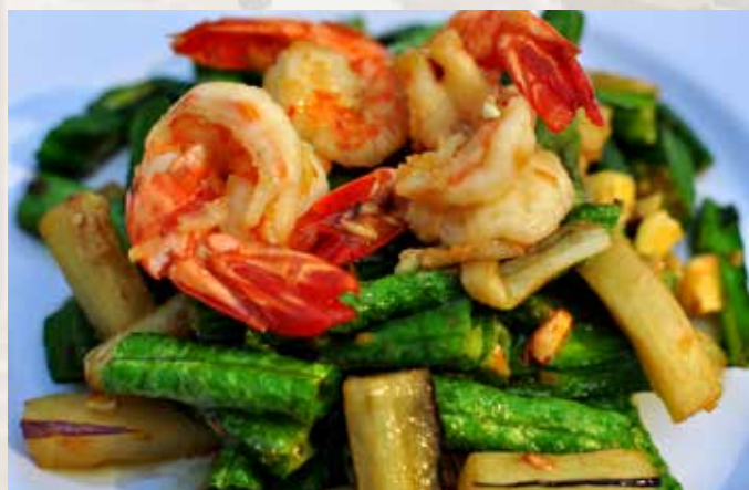
SE1 蒜米炒四大天王 Garlic Fried 4 Vege