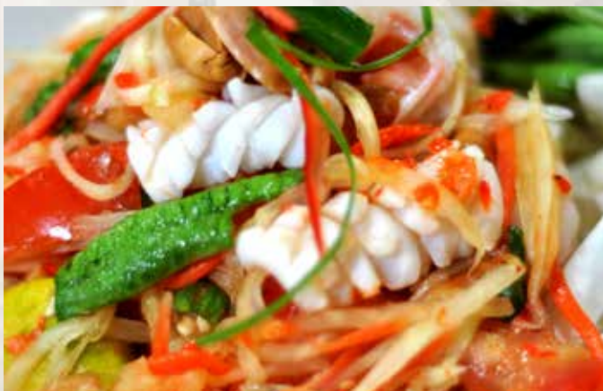
PPY3 泰式青木瓜沙拉 Seafood Som Tam