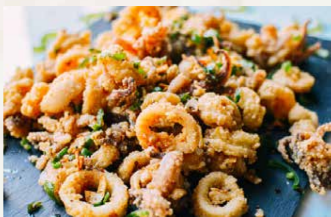
S2 蒜米炸苏东 (S)RM 20.00/碟 Squid Fried Chili White Garlic (B)RM 30.00/碟