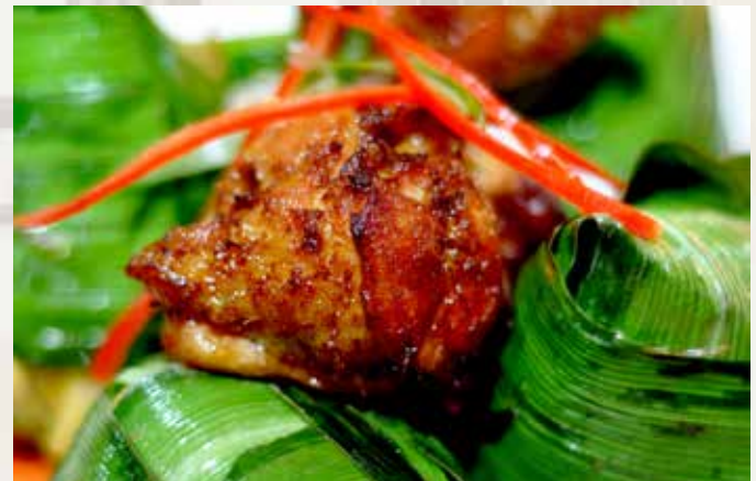
AP1 班兰叶炸香鸡 Pandan Leaf Chicken