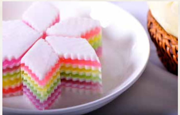
W16 层果冻 Layer Jelly