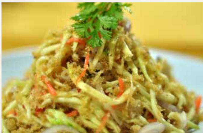
K2 炸鱼与芒果沙拉混合 (S)RM 12.00/碟 Fried Fish Thai Mango Salad (B)RM 18.00/碟