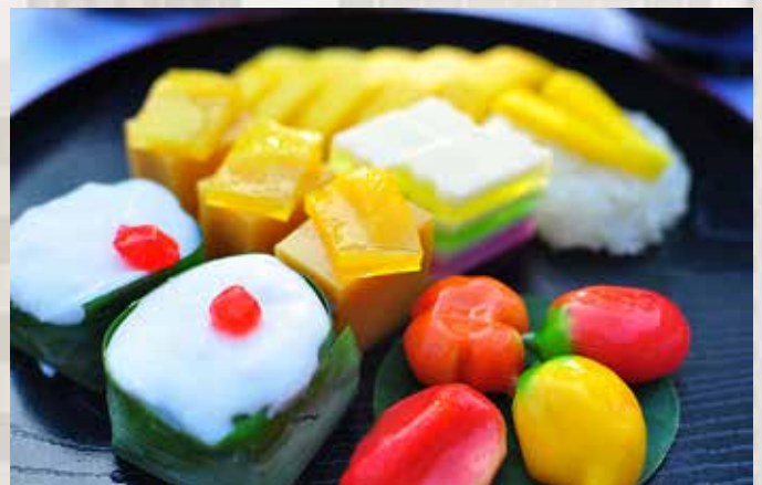
W18 甜品拼盘 Dessert Platter