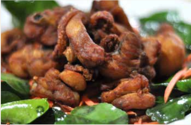
A1 柠檬叶炸香鸡 Lime leave fried with marinated chicken