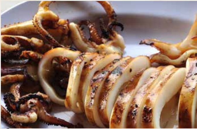
Q8 烧烤苏东 Bbq Squid