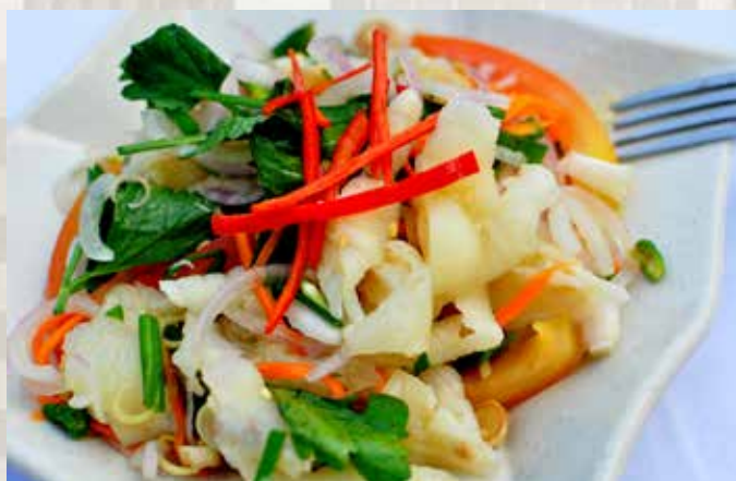
K7 鸡脚皮泰国沙拉 (S)RM 18.00/碟 Chicken Feet Thai Salad (B)RM 23.00/碟