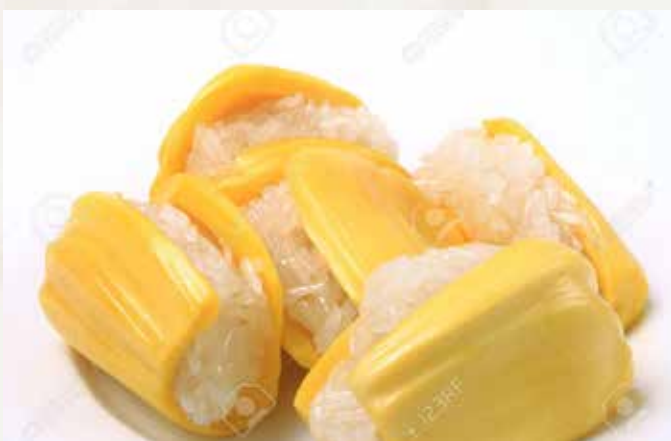
W14 Jack Fruit Stick Rice