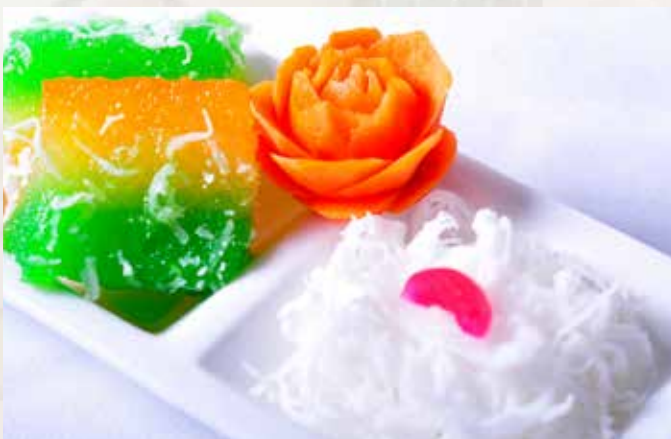
W15 Layer Pancake