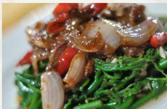
SP1 马来栈巴鼓菜 Belacan Paku Vege