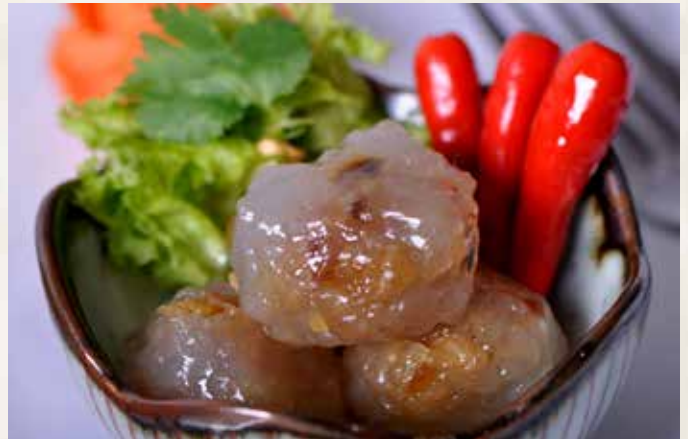
W4 Sago Thai