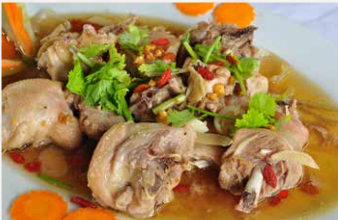
A2 蒸甘榜鸡 Steam Kampung Chicken