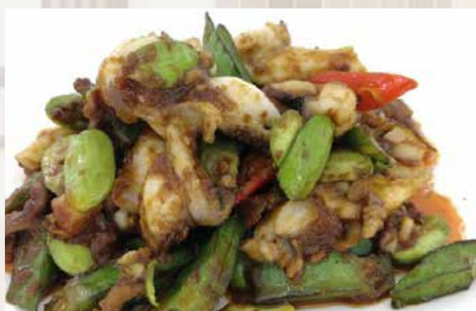
S5 汕芭炒苏东 (S)RM 23.00/碟 Squid Sambal Petai (B)RM 33.00/碟