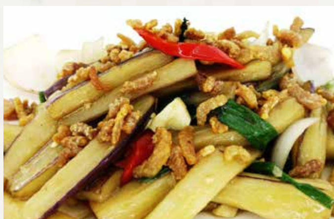
ST2 蒜米矮瓜 Garlic Fried Eggplant