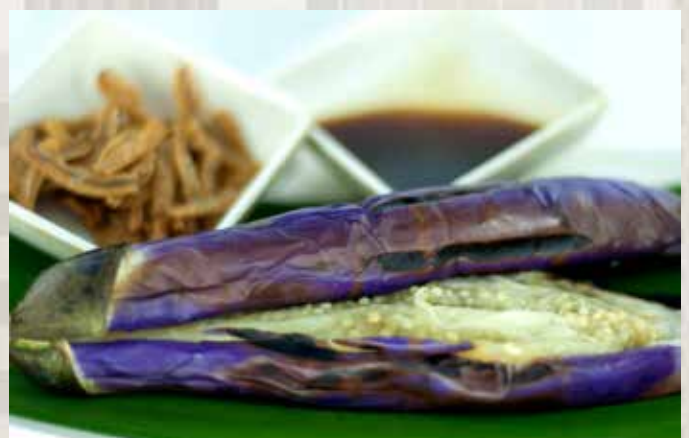
ST3 烧烤茄子 Egg Plant