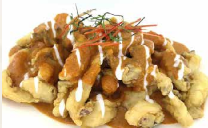
S1 椰汁辣椒苏东 (S)RM 20.00/碟 Squid Spicy with Coconut Milk (B)RM 30.00/碟